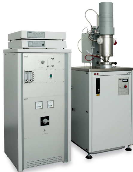
2 NETZSCH LFA 427