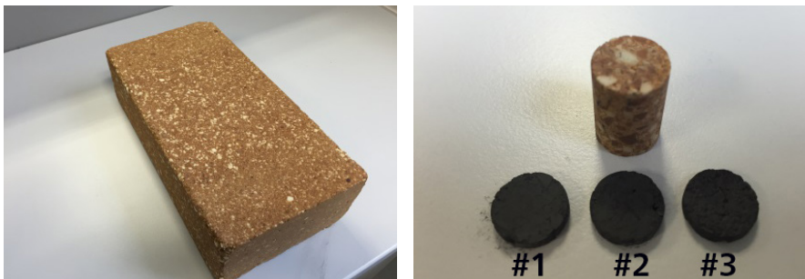
4 Magnesia-spinel brick (85% MgO, and 12% Al 2 O 3 ), measured with the TCT 426 (left) and the LFA 427 (right); the 3 LFA samples were coated with graphite.

possible now [1]. In addition, the fast testing times of the flash methods allow for measurements of various samples taken from the brick to be tested without further efforts. In the work described herein, the results from laser flash and the hot-wire measurements on a silicon carbide-containing brick and a magnesia-spinel brick are compared. Measurements were carried out on several small samples of the same material to check the homogeneity of the material and the reproducibility of the methods.