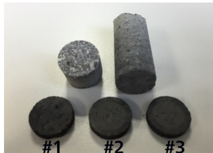
6 Silicone carbide-containing brick (45% Al_2O_3 , 29% SiO_2 , and 25% SiC), measured with the TCT 426 (left) and LFA 427 (right); the 3 LFA samples were coated with graphite.

Furthermore, the deviation between the different samples shows the possible range of the thermal conductivity due to the inhomogeneity of the magnesia-spinel brick. A similar comparison of LFA and TCT measurements on silicon carbide-containing brick (figure 6) is shown in figure 5. Again, the independent measurement values are all within \pm 10\% of the averaged data from the two methods combined.