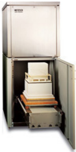
1 NETZSCH TCT 426