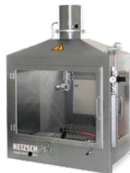
KBK 917 – Small Burner Box