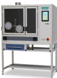
UL 94 – Fire Tester