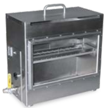
HBK 919 – Horizontal Burner Box