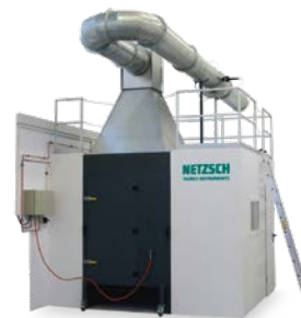
SBI 915 – Single Burning Item