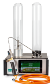
LOI 901 – Oxygen Index Analyzer