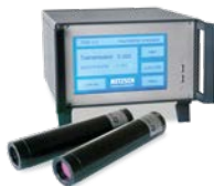
TRDA – Smoke Density Tester with light measurement system