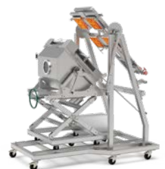
TDP T4 – Fire Testing for Roofs