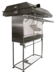
TBB 913 – Floor Radiant Panel