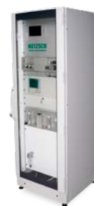
KBT 916 – Fire Testing for Cables