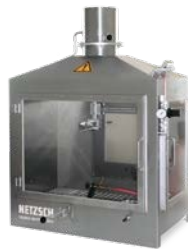
KBK 917 – Small Burner Box