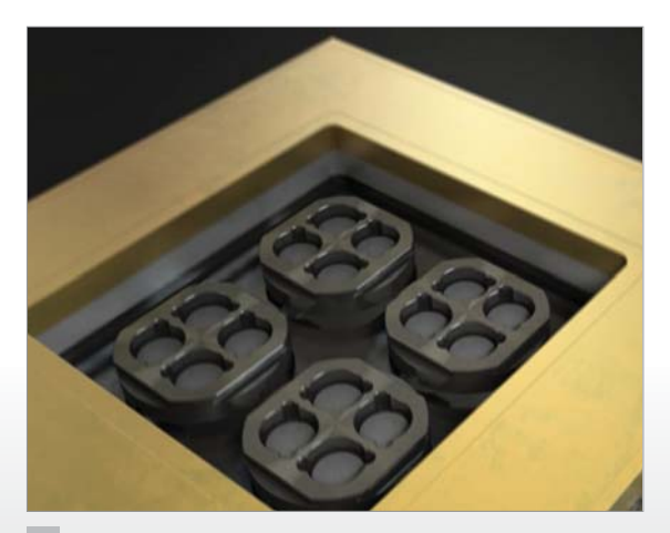
1 Sample Changer for up to 16 samples

The LFA 467 HyperFlash by NETZSCH is able to measure 16 samples within one turn (same heating rate). The sample changer for up to 16 samples is presented in figure 1.